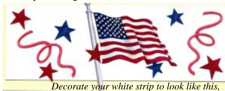
Decorate your white strip to look like this, then cut into 1 1/4" thirds

12. Cranberry strip 12" x 2", White torn strip 12" x 1/2". Royal Blue strip 1 1/2" x 4 1/2", White strip starts out as 1 1/4" x 3 3/4" strip then cut down into thirds leaving (3) 1 1/4" squares using the Personal Trimmer.